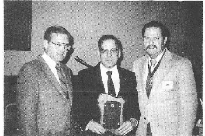
1987 SENIOR CITIZEN AWARD AND SHIELD AWARD RECIPIENTS