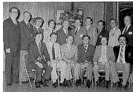
Union Council Officers and State Officers.