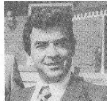
Knight of the Month February 1987