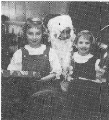
Santa arrives early at Knights of Columbus

While hundreds of Councils have proudly distributed copies of the amended Pledge on manifold public occasions, we now urge ALL members to participate in its promotion on an ever increasingly powerful scale.