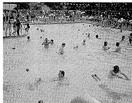
Please give this pool a chance to stay, as lovely as it is to-day. Give us some time and you will see how great a place our Club can be.

Swim Club Members, if you would like to participate in a truly fraternal activity with your Brother Knights, come out and join them on the Saturday Morning Work Party.