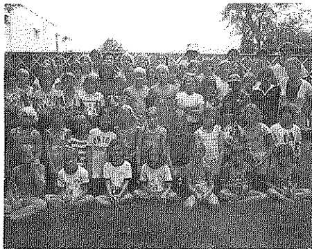
The swim team includes the following:

A pizza party was held on Saturday, August 27, 1977, at the Knights of Columbus picnic area for all swim team members, timers, judges, starters and all behind the scene personnel who helped make the season a successful one. Trophies were awarded to all members of the swim team.