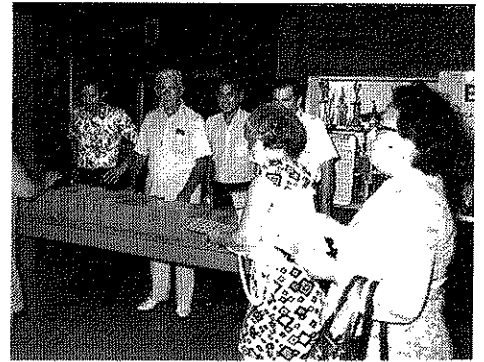
The Bingo crew welcomes enthusiasts on August 27. The event netted $1013.