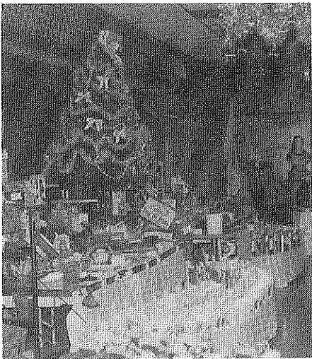
A view of the Chinese Auction before the 300 people arrive.

For Reservations Call Gene Dougherty 762-1137