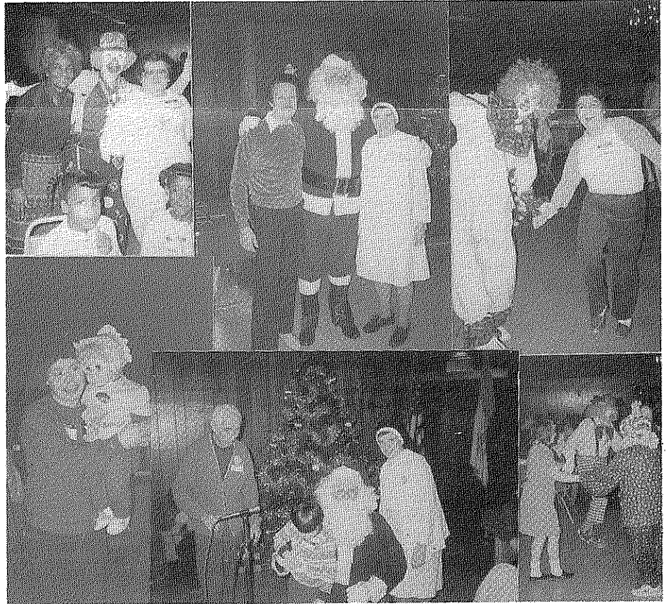
(MORE PHOTOS INSIDE)