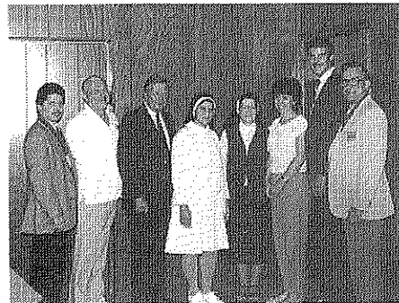
PRESENTATION OF PROCEEDS FROM THE ANNUAL RETARDED CITIZENS DRIVE