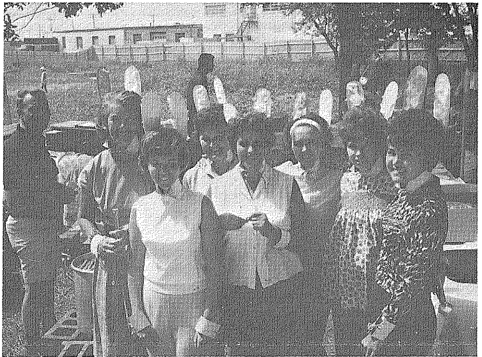
Part of "Bunny" serving committee as they appeared at Council Picnic.

Our appeal to you now is two-fold. 1) If you haven't pledged, won't you do so NOW?? 2) Join our pledge committee. This is a golden opportunity to help your Council grow in two ways — by pledging, and by helping on the committee. Help yourself and your Council to a bigger and better future . . . PLEDGE NOW.