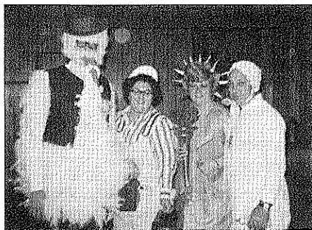
CAN YOU GUESS who the goblins brought to our Halloween Party?

Owe No Man Anything, But To Love One Another