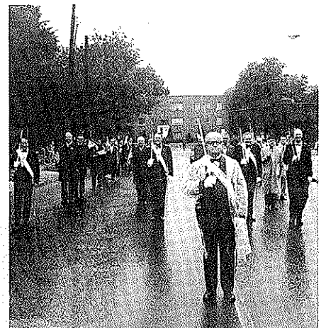
A contingent of some of Union Councils' Finest stepping out at the annual Memorial Day Parade.