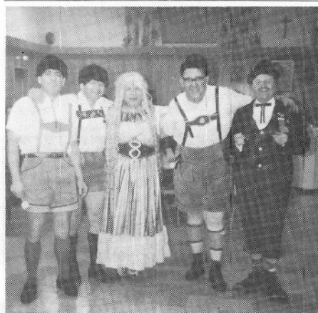
Some of our brother knights on German Night. Can you guess who they are?