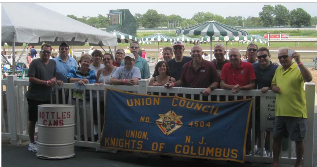
Photo of the group that went to Monmouth Race Track in July. A great time was had by all.