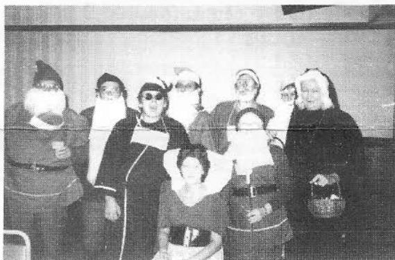
Hi Ho! Hi Ho! Off To Work They Go