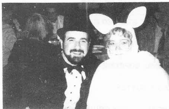
Who Pulled The Rabbit Out Of The Hat